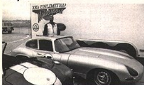
Jason with the E-Type in its current form.